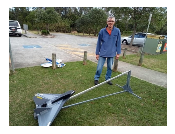
The V1's had a similar launch pad.

him before he left. It's been tidied up, bound and a receiver and battery inserted and hey presto after a couple of flights is ready to train novices. (Photo on right).